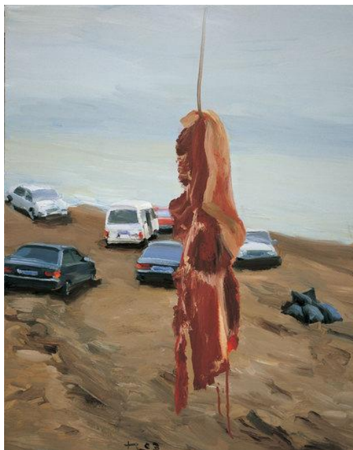
A Bunch of Pork at River , Liu Xiaodong, 2003, oil on canvas