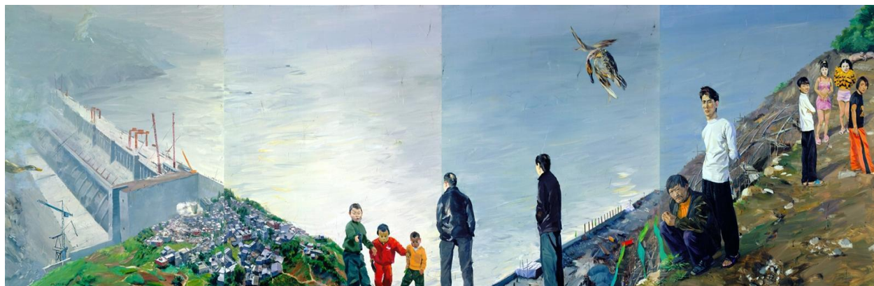
Newly Displaced Population , Liu Xiaodong, 2004, oil on canvas

Similar to the painting Great Migration , Newly Displaced Population was also reproduced from photographs in Liu's studio in Beijing. The fragment of the duck comes from a photograph in a magazine. Figures that were depicted in the two paintings are not all locals from the Three Gorges area. Since they are fragments from photographs, the element of three children appears in both paintings, but a different composition in the larger scale with more detailed depiction in Newly Displaced Population . According to Liu's photographs, two young men on the first panel on the right are from Baidicheng, and three prostitutes on the same panel were photographed by Liu in an apartment in Beijing, who also appear in Liu's painting Prostitutes No. 9 in 2001. In this painting, different people from different places were juxtaposed with the landscape of Three Gorges, representing a disjunctive presence (Decrop 101). Liu's use of fragments becomes more explicit in his painting Hotbed No. 1 ; without the use of photographs, fragments of time and space still exist by painting from life on site.