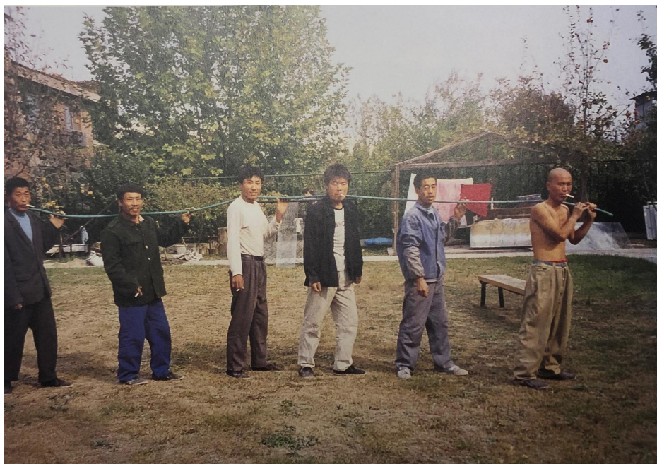
Migrant workers in yard of my studio , Liu Xiaodong, photograph

As I have mentioned before, Liu's practice of combining fragments from photographs is also applied in this painting, which results in an abrupt disconnection between figures and landscape. Without the reference of Three Gorges in the title, no direct association of that region can be made from only viewing the painting. The landscape only functions as a backdrop behind the human figures. Instead of responding to the alteration of landscape, Liu primarily focuses on human activities and represents a chaotic scene of a variety of people in this painting. This group of six labors is placed dominantly in the foreground. They are neither situated in the landscape nor interacting with it. Their distinctive costumes, motionless gestures, and emotionless facial expression, all make it as a staged performance.