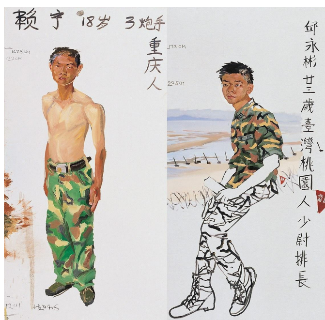
Battlefield Realism: Images of the New Eighteen Arhats , Liu Xiaodong, 2004, oil on canvas

In addition to the intensity of emotion that it conveys, for Liu Xiaodong, good artwork also depends on the amount of information it shows (Wu 6). Therefore, to help him to deliver more information within the limitation of the medium of oil on canvas, Liu chooses to combine elements from different photographs, incorporating these disparate fragments into one single painted image, and arranging them in an unusual combination (Liu 58). However, these fragments were never situated in the same space or time. The combination of fragments lends a certain oddity and awkwardness to Liu's painting, creating a surrealistic world. Despite being rendered in a realistic style, these fragments are artificial, separated from the real world. By "surrealistic", Liu points out that it is not the surrealism of Salvador Dalí, rather, the real world itself is a surrealistic one without a unified narrative ( 57).