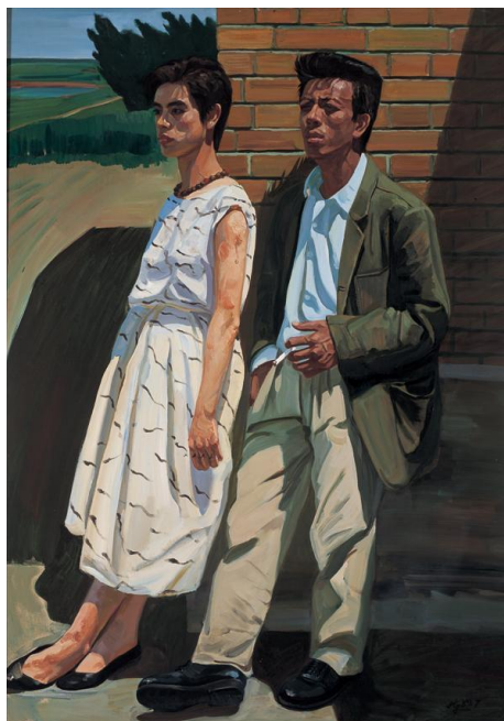
Pastorale , Liu Xiaodong, 1989, oil on canvas