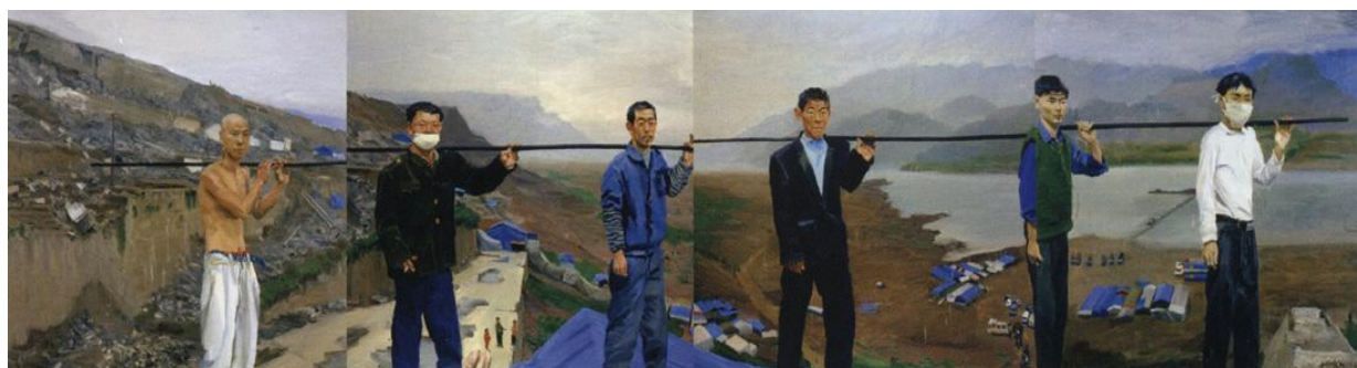
Great Migration at the Three Gorges , Liu Xiaodong, 2003, oil on canvas

As I have mentioned before, Liu's practice of combining fragments from photographs is also applied in this painting, which results in an abrupt disconnection between figures and landscape. Without the reference of Three Gorges in the title, no direct association of that region can be made from only viewing the painting. The landscape only functions as a backdrop behind the human figures. Instead of responding to the alteration of landscape, Liu primarily focuses on human activities and represents a chaotic scene of a variety of people in this painting. This group of six labors is placed dominantly in the foreground. They are neither situated in the landscape nor interacting with it. Their distinctive costumes, motionless gestures, and emotionless facial expression, all make it as a staged performance.