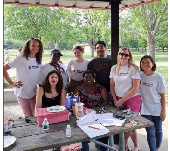
2023 Perinatal Connect Community Event at Hessel Park in Champaigr